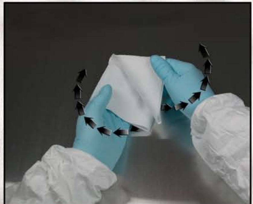
(4) Refold the wiper as shown in step (2) to enclose the two contaminated faces and expose the two clean faces. Repeat step (3) using the two clean faces.