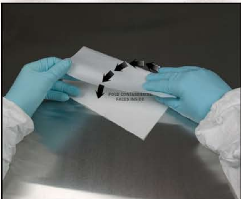
(5) Wiper may be completely unfolded, reversed, and refolded beginning again at step (1) to enclose the four contaminated faces and expose the four remaining clean faces.

Berkshire ENGINEERED CLEAN WWW.BERKSHIRE.COM