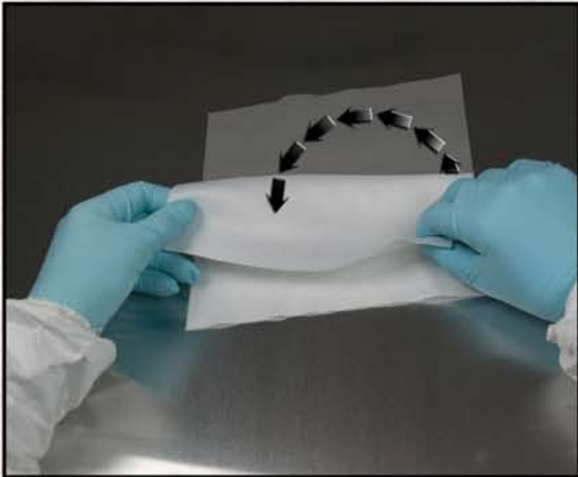
(1) Place the wiper flat on the surface. Take the two farthest ends from you and bring them towards you, folding the wiper in half.

Proper folding of the wiper will maximize efficiency and utilize eight clean wiping strokes.